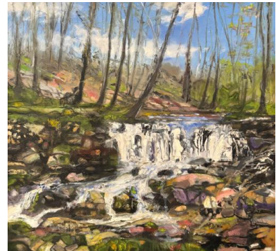
Anne Leith , Platte Clove , oil on board, 2024 24 x 24