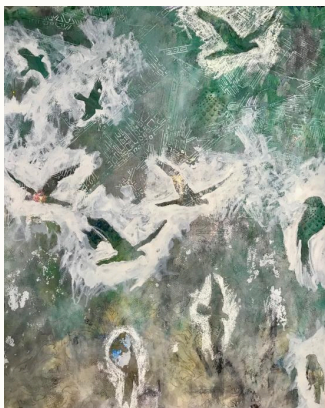
Robin McClintock , Understood , 2018, 30 x 24 in