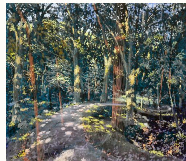
Martin Weinstein , Road Through Oaks, Evening , 2017, acrylics on multiple acrylic sheets, 28 x 28 in