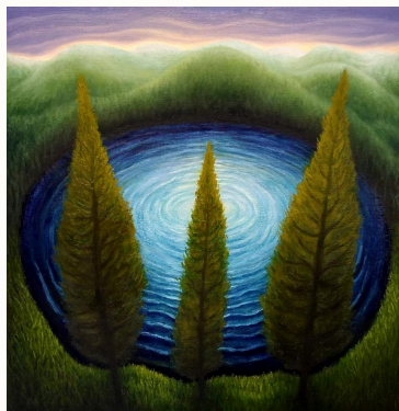
Laura Von Rosk , Three Cedars at the Lake , oil on board 10 x 10 in