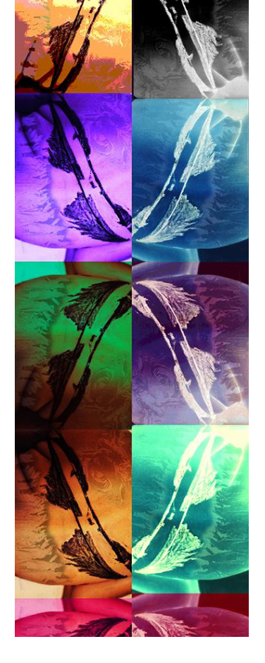
#1Toes © Kaethe Kauffman 2022 limited edition print on silk 36 x 72 inches copy