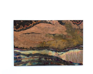
CHERYL SAFREN STRATA, 2017 Chemistry on copper 24 x 36 in.

underneath which is a colorfully mottled, thinner layer. All colors and shades of brown are entirely created by chemical reactions. It might also look like a mountain by the shore of the sea. The associations we make with the image are based on Safren's ability to infuse it with multivalent meaning. There are works like this whose interpretation can go in a number of directions, and the inchoate nature of her forms leads us to pick and choose among a number of possibilities. Also, the fidelity of the image to nature large and small makes it clear how fertile the natural world is in terms of possible readings. Vian Borchert's 2021 suite of black-and-white paintings—from top to bottom, Counter Ceiling, Buildings, Windy City, Rooftop Dreams—present urban scenes in black on a white background. Urban structures—right-angled building forms—are partially rendered, creating a language of nearly visionary architecture. Sometimes, in small passages in parts of paintings, something free-flowing and abstract, not unlike the effects of a Franz Kline work, emerges. These works capture the spirit of urban life in memorable ways. When an artist like Borchert calls upon what she actually sees, she also has a habit of making it a bit more dramatic than life. The results are, as the title of the show says, "singular."